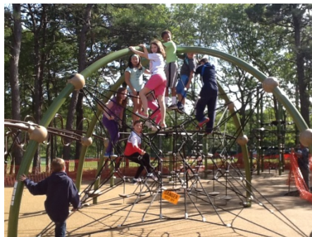
Our New Playground!