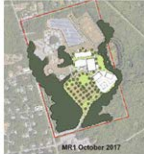
MR1 MATTACHEESE SITE ALL NEW (GR. 6-7)