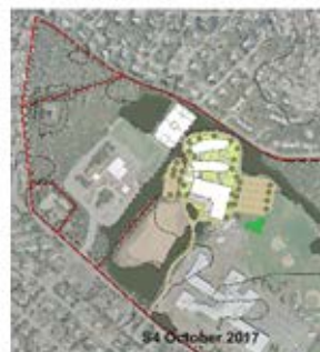
S4 STATION AVE. SITE ALL NEW (GR. 4-7)