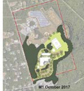
M1 MATTACHEESE SITE ALL NEW (GR. 6-7)