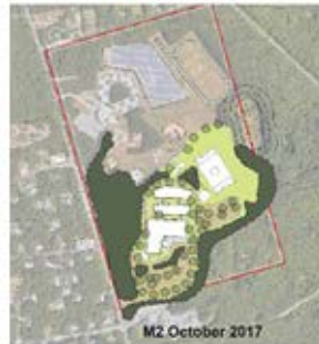
M2 MATTACHEESE SITE ALL NEW (GR. 4-7)