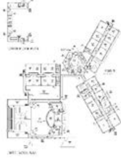
MRX MATTACHEESE SITE CODE + REPAIRS ONLY