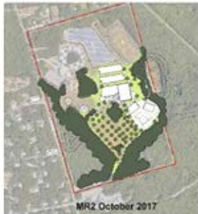
MR2 MATTACHEESE SITE ADD/RENO (GR. 4-7)