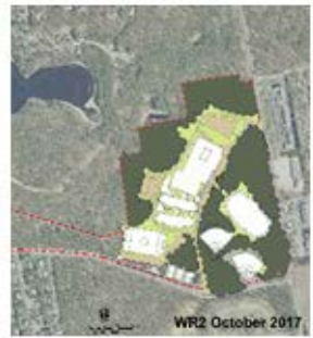
WR2 WIXON SITE ADD/RENO (GR. 4-7)