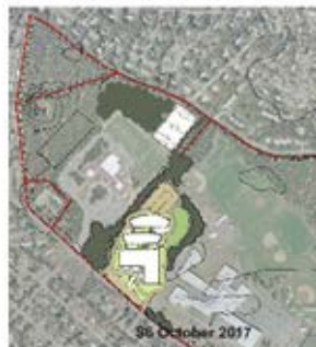
S6 STATION AVE. SITE ALL NEW (GR. 4-7)