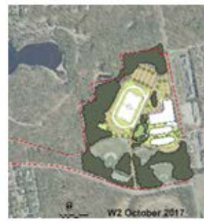
W2 WIXON SITE ALL NEW (GR. 4-7)