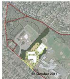
S5 STATION AVE. SITE ALL NEW (GR. 6-7)