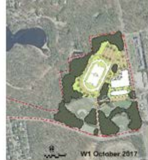
W1 WIXON SITE ALL NEW (GR. 6-7)