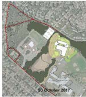
S3 STATION AVE. SITE ALL NEW (GR. 6-7)