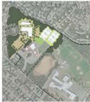
S1 STATION AVE. SITE ALL NEW (GR. 6-7)