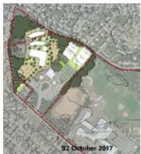
S2 STATION AVE. SITE ALL NEW (GR. 4-7)