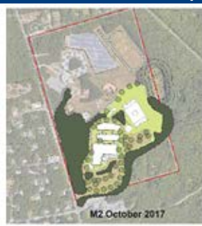
M2 MATTACHEESE SITE ALL NEW (GR. 4-7)