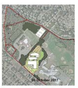
S6 STATION AVE. SITE ALL NEW (GR. 4-7)