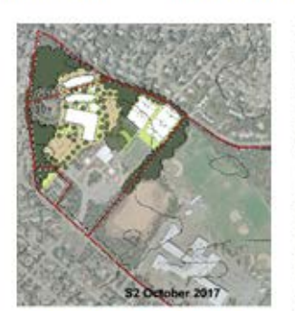
52 STATION AVE. SITE ALL NEW (GR. 4-7)