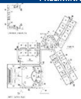
MRX MATTACHEESE SITE CODE + REPAIRS ONLY