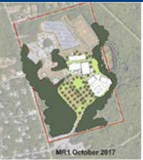
MR1 MATTACHEESE SITE ALL NEW (GR. 6-7)