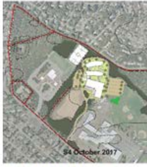
S4 STATION AVE. SITE ALL NEW (GR. 4-7)