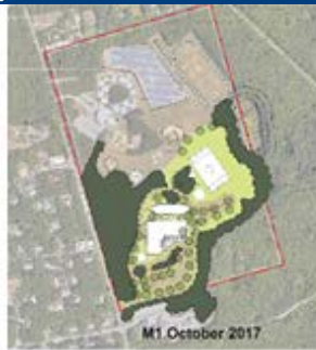
M1 MATTACHEESE SITE ALL NEW (GR. 6-7)