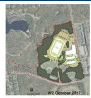
W2 WIXON SITE ALL NEW (GR. 4-7)